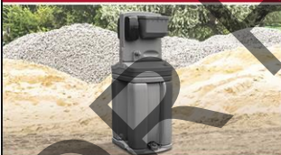
Hand Wash Stations